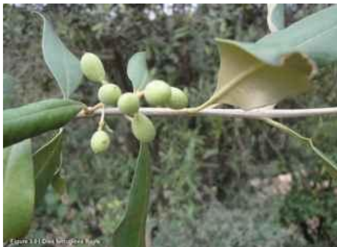
Figure-3. Olea ferruginea

0.040-0.050 Kg of crisp greeneries is bubbled every day in 2 dishes (0.5L) of H 2 O for 11-17 minutes. At the point ounce, 1 mug (0.25L) of H 2 O is gone, it is stressed and set to a patient experiencing teeth ache, gums, roughness, and sore throat. For youngsters, 2 10-15 mL of extracts is utilized thrice daily for three days. Grown-ups, 125 mL of extracts is utilized thrice daily up to 4 days. It is utilizing for mouth wounds, toothache, throat agony, and roughness. The nearby name of Olea ferruginea is (shoon) and Family name is Oleaceae as given in Figure-3.