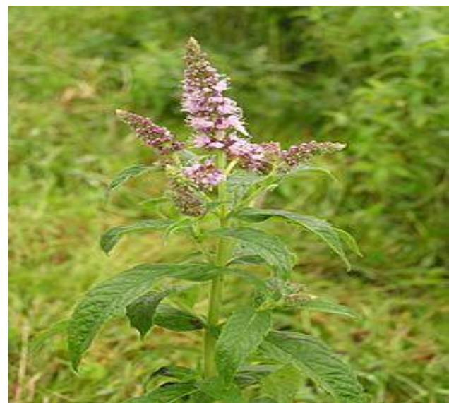
Figure-2. Mentha longifolia

Mentha longifolia (Horse Mint); [5] syn. “ Mentha spicata var. longifolia L., M. sylvestris L., Mentha tomentosa D’Urv, Mentha incana Willd”.) is a specie in the class Mentha (mint) local to European , west and focal Asian (eastern Nepal and the most distant western of Chines regions), and north and south of Africa [6-8] . It is a truly factor herby perpetual shrub with a fragrance of peppermint. In the same way as other mints, it has a crawling rhizome, with erect to crawling stems 40–120 cm tall. The leaves are elongated curved to lanceolate, 5–10 cm long and 1.5–3 cm wide, daintily to thickly tomentose, green to grayish-green above and white underneath. The blossoms are 3–5 mm long, lilac, purplish, or white, delivered in thick bunches (verticillasters) on tall, stretched, decreasing spikes; blooming in mid to pre-fall. It spreads through rhizomes to shape clonal settlements [9-10]. The nearby name of Mentha longifolia is (Sheenshoumbai) as given in Figure-2 beneath: