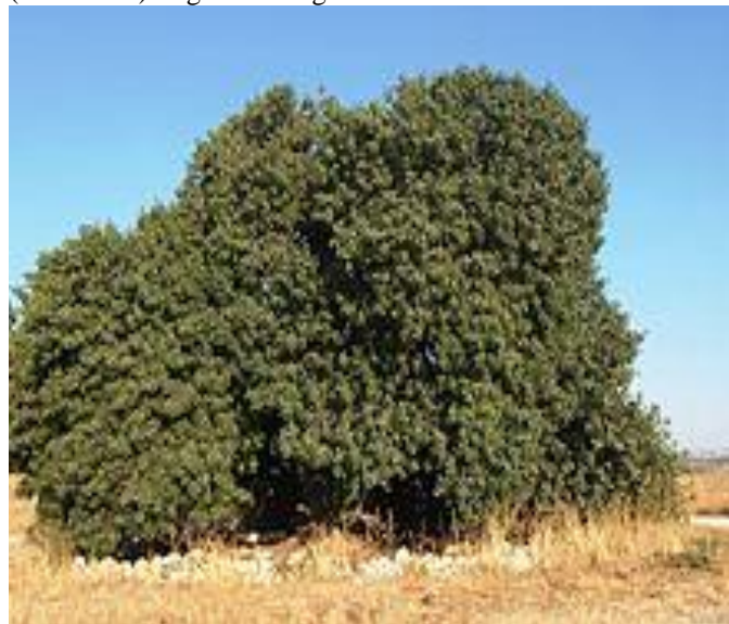
Figure-4. Pistacia atlantica

estimating 2 m (6 ft 7 in) in distance across; it might take 200 years for a tree to achieve 1 m (3 ft 3 in) wide [12]. The leaves are pinnate, each with seven to 9 spear formed handouts. The neighborhood name of Pistacia atlantica is (sherrawon) as given in Figure-4.