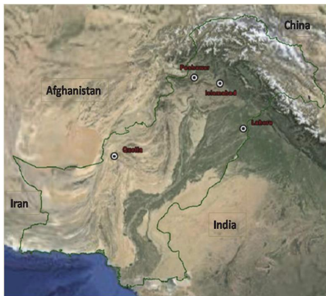
Figure-1. Map of Quetta city at the world level.

Pakistan's province Balochistan possesses an exalted city Quetta, which is positioned at 30°13'N 67°01'E. It's a shell-shaped dale with an altitude of 1680m encircled by sierras and saws with a summit altitude of approximately 3000 m and >sea level [1] Quetta has an area of 2653k/m 2 with a populace of approximately 0.9M people. Quetta has Marcie meteorological conditions and it doesn't facilitate torrential (monsoons) rain showers. The air surveillance station is set up at the canopy ridge of metropolis construction in Zarghoon-Town of Quetta. Automotive emanations are the biggest cause of environmental effluents in localities of surveillance stations. The city is blessed with 4 different seasons, namely winter (Dec-Feb), spring (Mar-May), summer (Jun-Aug), and fall (Sept-Nov). The periodic average of seasons has been calculated with the purpose of finding out the deviation of PM 2.5 M.C in different seasons. The map location of Quetta city at the world level is given below in Figure-1.