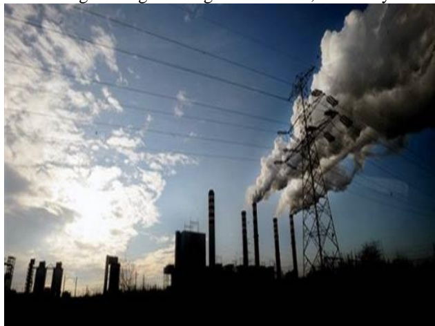
Figure-2. Pollution situation in major cities of Pakistan.

In addition to the identification of the places and protocols for monitoring and regularizing air effluence, this study work