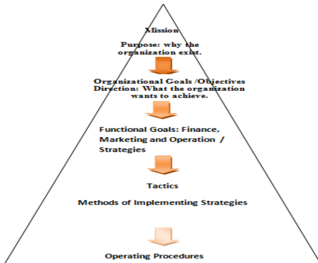
Figure 2: Organizational Decision Making Process

than strategies, and they provide guidance and direction for carrying out actual operations. Thus, it needs to be a more specific and detailed plans and decision making in an organization [57-20]. In general, tactics could be viewed as the “how to” part of the process (e.g., how to reach the destination, following the strategy roadmap) and operations as the actual “doing” part of the process [57-54-53]. This general relationship that exists from the mission down to the actual operations in the organization is hierarchical. This is illustrated in Figure 2.