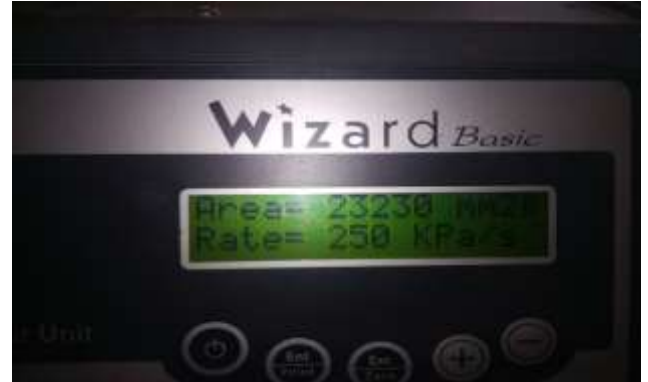
Fig.2: Setting loading rate and area of sample

tank and allowed to dry for 24 hours to make them ready for testing. After that, the cubes were tested in the compressive testing machine of 3000 KN Capacity. The machine was manually set to apply the load at the rate of 250 Kpa/s while the area of the cube was 23230 mm 2 as shown in the Fig 2. The compressive strength of GPC cubes was found to be less than the designed because the GPC required oven curing and we used sample water curing that’s why GPC have low strength as compare OPC.