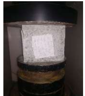
Fig.3: Compression Testing Machine