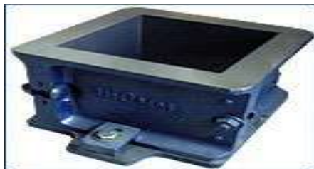
Fig.6: Cubic Mould