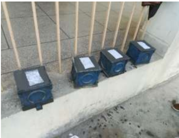
Fig.1: Prepared compacted sample

Concrete mix prepared from the material chosen with respect to combination by the ratio derived from the ACI mix design and cast in the laboratory. First of all concrete mix of local materials like Ordinary Portland cement locally avail crush and Chenab sand were mixed with the ratio designed 1:2:4 and water added according to the mix design (W/C = 0.50) and added quantity of Sodium Hydroxide and Sodium Silicate. Oiled the mould of size 6”x6”x6” and poured the materials in 3 layers compacting each by 25 strokes of tempering. Eight other cubes were also casted by repeating the same procedure as described above. The ingredients of all these combinations are shown in the Table 1.