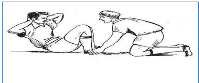
Figure (2): Demonstrates the test of the strength of the muscles of the abdomen

Record the correct number of times (until the voltage is exhausted)