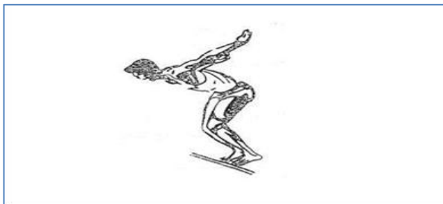
Figure (3): The continuous foot-jumping test shows the maximum distance per minute of the force (leg muscles)